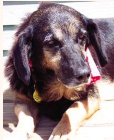
Little Miss Maisy

Maisy is a German Shepherd/Basset Hound mix who excels at all things comfortable. She has a knack for making people smile and embracing her short-comings in life (ahem, her legs!). Rescued from a kill shelter where her age and her silly looks had the odds stacked against her, she has now become a priceless member of the Young At Heart Community Outreach Team! She is currently undergoing training to pass her Canine Good Citizen Test (and she says to tell you that it's a piece of cake!), and can't wait to try start meeting new friends!